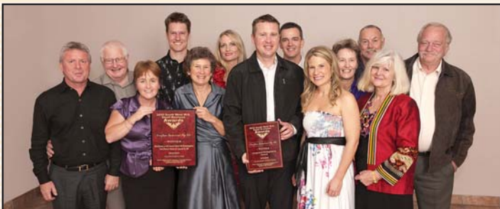
Photographs from top: Overflow Industrial's Bunbury Office, giant mining equipment the company has worked on and the company's present and past ownership team with some of their recent awards.

"I have great respect for the people who work for me and am grateful for their commitment – I consider them like family and am proud to represent them."